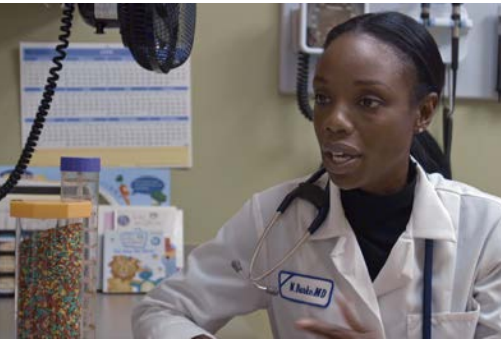
Nadine Burke Harris, MD Pediatrician CEO, Center for Youth Wellness San Francisco, CA