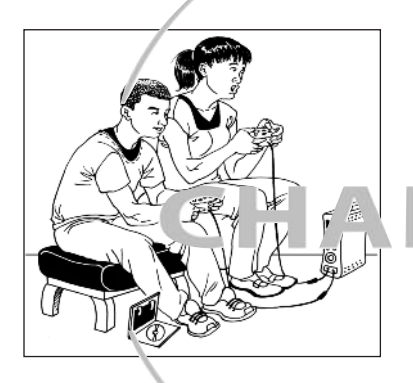
Play a game on your computer