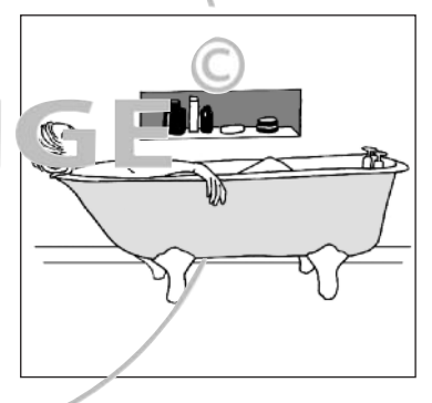
Have a bath