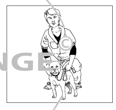
Stroke the dog / cat