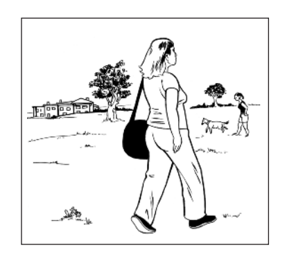
Go for a walk