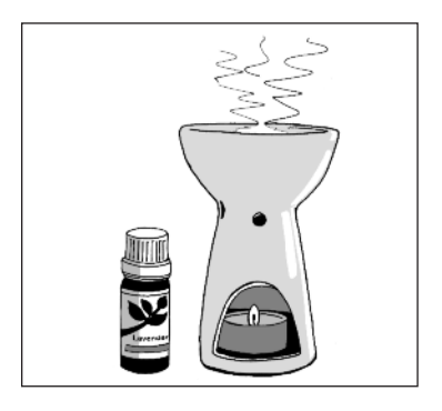
Use some essential oils