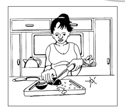
Cook your favourite meal