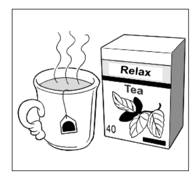
Have a soothing drink